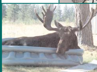
Bill Tester sends this photo and says, "You know it's hot in Montana when..."