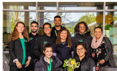
Student Services ambassadors, classified professionals, counseling faculty and administrators stand ready to greet guests at Family Orientation.