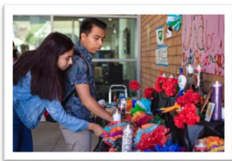
Two students decorate the ofrenda .

For Los Días de los Muertos , a Mexican holiday that celebrates those who have passed and takes place Nov. 1 and 2, the Dreamers Movement Club created an ofrenda , or altar honoring deceased loved ones, outside of Bldg. 10. The ofrenda featured papeles picados , traditional tissue-paper banners; photos of loved ones; replications of favorite meals; photos and candles. Students, faculty and staff were invited to write a note to a loved one as part of the ofrenda . It was in place through Tuesday, Nov. 12. The club's members include undocumented students and their allies.