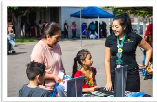
An outreach ambassador speaks with a family.

Grossmont College participated in the 2019 Multicultural Festival at EJE Academies in El Cajon. Sponsored by the Welcome Newcomer Network, the event featured free food, live music, children's activities and resource tables. The college's Outreach Department and Career Services staff attended the event, which is a celebration of the refugees, asylees and recent immigrants who call East County home. The Welcome Newcomer Network is a coalition of more than 50 social service agencies, school districts and faith-based organizations serving East County.