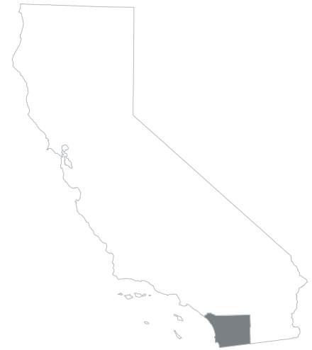
GCCCD SERVICE AREA IN CALIFORNIA

T HE Grossmont-Cuyamaca Community College District (GCCCD)* creates value in many ways. The district plays a key role in helping students increase their employability and achieve their individual potential. The colleges draw students to the county, generating new dollars and opportunities for San Diego County. The colleges provide students with the education, training, and skills they need to have fulfilling and prosperous careers. Furthermore, the colleges are places for students to meet new people, increase their self-confidence, and promote their overall health and well-being.